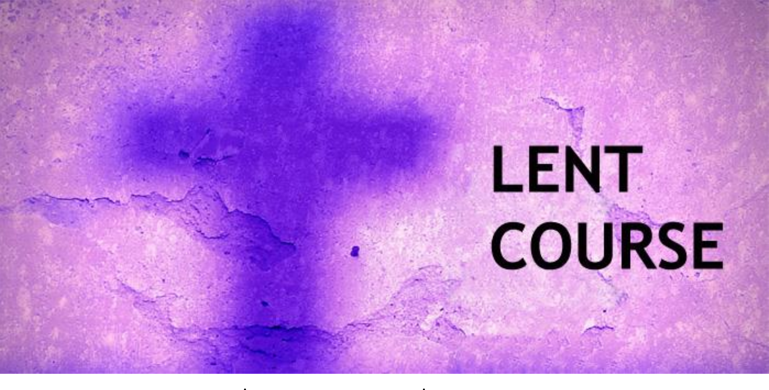
Wednesdays - 5<sup>th</sup> March to 16<sup>th</sup> April - Details to follow